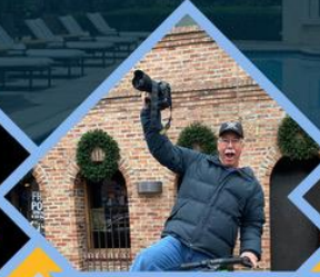
MICHAEL COLLINS Photoshop - Zero to Sixty in a Week