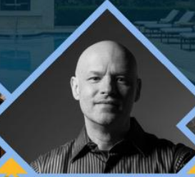
SCOTT DETWEILER AI & Portrait Photography