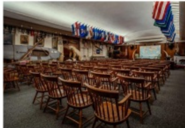
The Adventurers' Club of Los Angeles