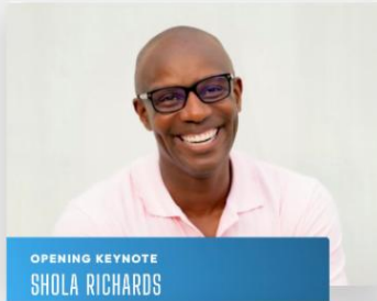
OPENING KEYNOTE SHOLA RICHARDS

Discover new ways to transform your business with an inspiring keynote presentation.