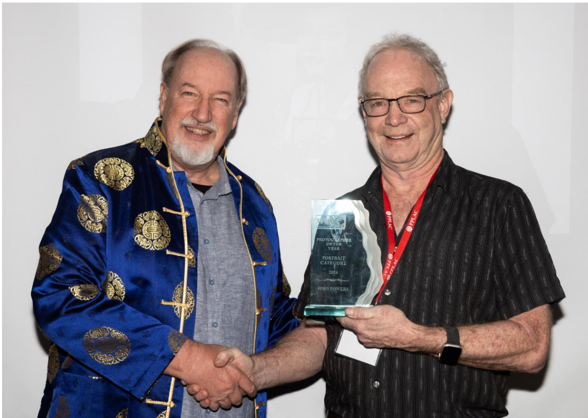
New PPLAC Award Category