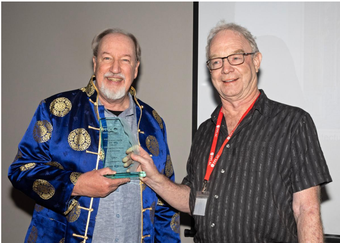
2024 PPLAC Photographer of the Year Landscape Category