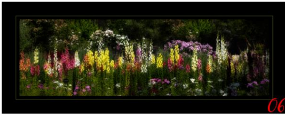
Second Place: Angela Chen